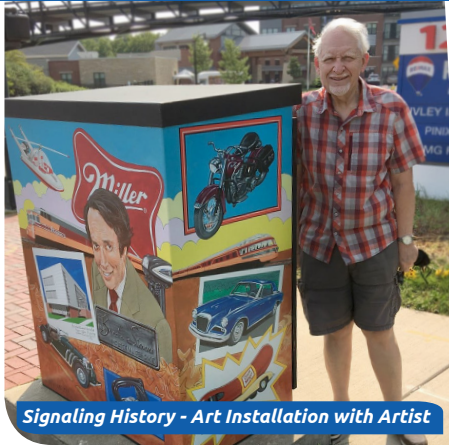
Signaling History - Art Installation with Artist

Thank you for making a difference in the Village of Shorewood. CELEBRATE • CONNECT • SUSTAIN